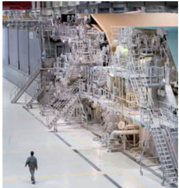
Gases and know-how from Messer optimise many areas of paper production.

If you have any questions regarding our tailor-made processes for the paper industry or would like an individual consultation with our application experts, please do not hesitate to contact us.