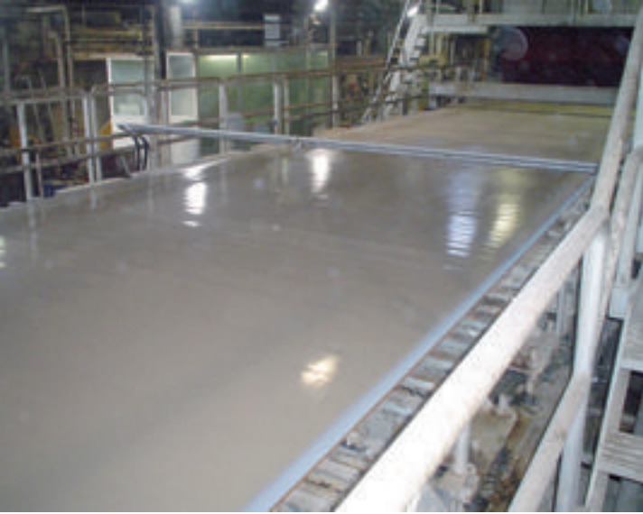
Dewatering of the pigment suspension